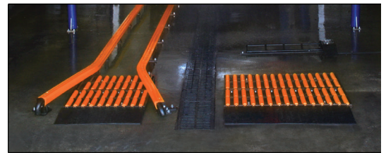
*Shown w/above ground correlator and optional DXD Y-Section