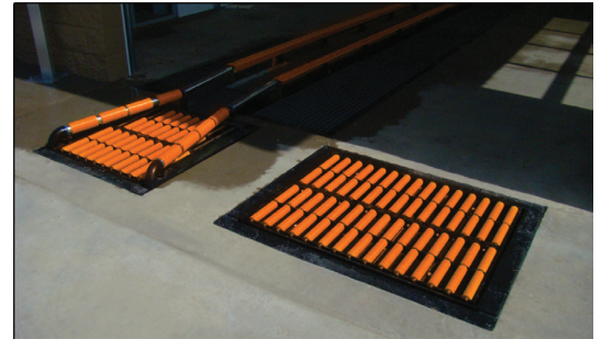
*Shown w/standard inground correlator and optional Stainless Steel Y-Section

Passenger's Side Length 3' 7" (w/ramp) Passenger's Side Width 3' 5"