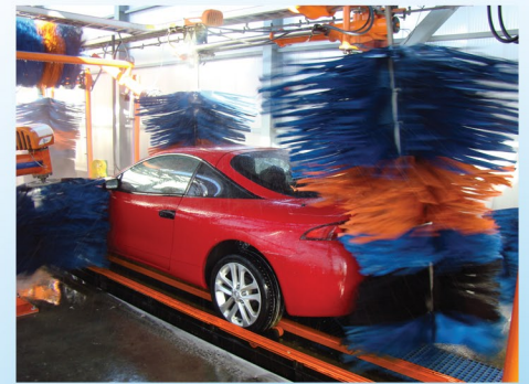
At 200+ vehicles per hour, Belanger's patented QuickFire® is the market's most powerful front, side, and rear vehicle washing wrap