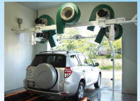
Belanger's touchless dryers are engineered with the latest in energy-efficient and safety technology and come in a broad variety of design and HP configurations