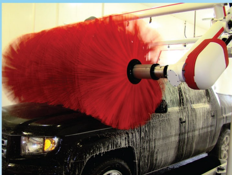
Designed as a dedicated horizontal surface washer, the Whisper Wheel® excels at cleaning hoods, roofs, and trunk lids – all while providing a super-quiet customer experience