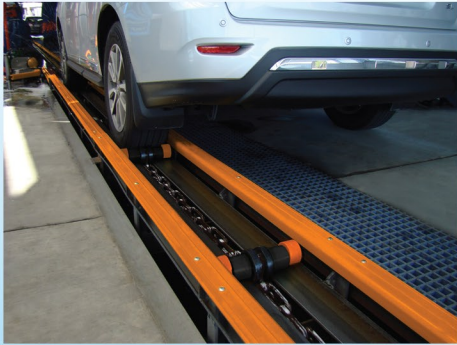
The award-winning DuraTrans® XD conveyor offers the most complete features and operator-friendly functionality available in the industry